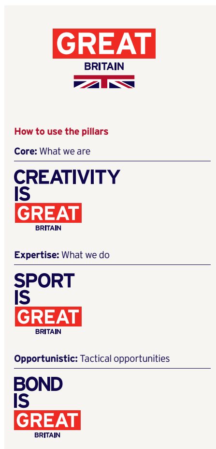
Extract from the GREAT guidelines

The brand is embraced, endorsed and used consistently by 17 Government departments and 350+ private and public partnerships in 144 markets around the world to target specific audiences and opportunities.