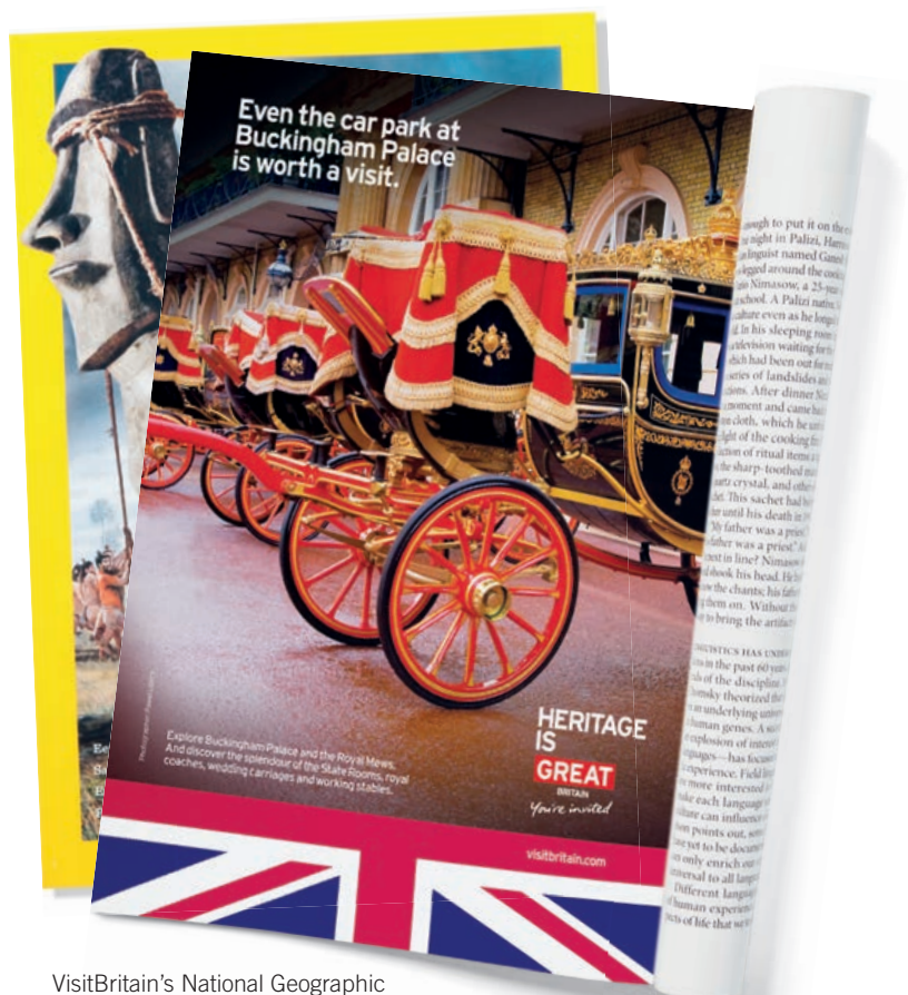
VisitBritain's National Geographic campaign (12 markets – 4 languages)

A large proportion of the campaign is about showcasing UK people and partners, so the system also allows the ability to leverage this.