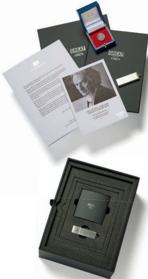
GREAT Ambassador's pack

“The GREAT Britain campaign is a tremendously important initiative and one that I think has been very effective, not resourced enough in terms of spending. It is certainly a wonderful example, probably the best example that I’ve come across, of an integrated campaign for a Government and a country across the world. In fact I think it’s an iconic campaign because I think it pulls together so many different aspects of Government on one platform, one template which all those departments and Ministers and Ministries can use... Campaigns like the GREAT campaign are absolutely critically important in getting companies to think about exporting abroad, think about growing abroad, and capitalising on the opportunities.”